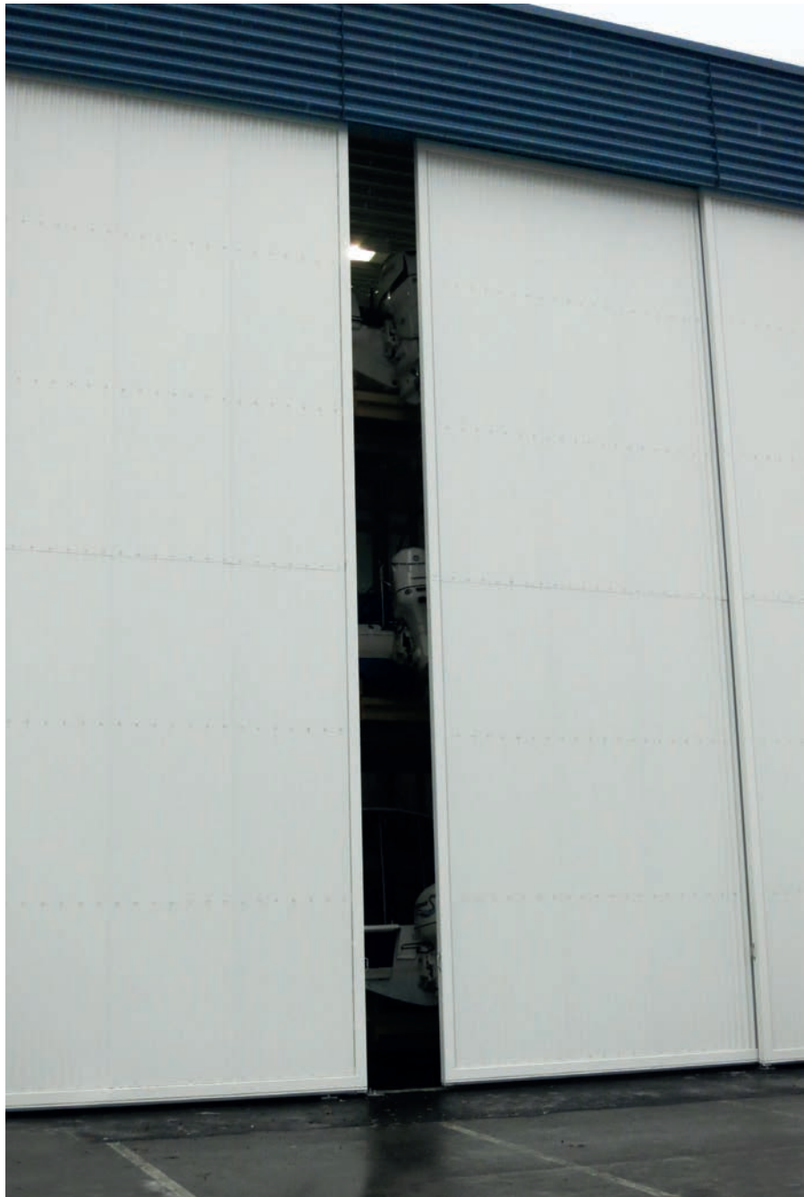
↖ The sliding doors of the massive warehouse halls in Hernesaari, Helsinki, use the 2000 series sliding track systems